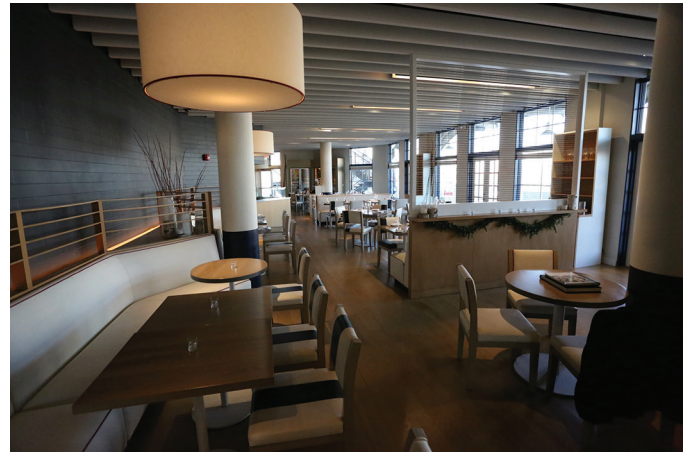
Wi-Fi coverage available inside restaurant at Maritime Parc

"With airFiber and our tech infrastructure, Maritime Parc is now a one-stop shop."