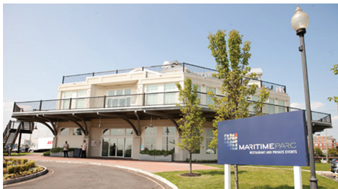
Maritime Parc, Liberty State Park, New Jersey

To provide bandwidth for Maritime Parc’s services, MST chose Ubiquiti Networks airFiber radios. The Ubiquiti Research & Development Team designed airFiber to create a high-performance wireless backhaul. airFiber provides excellent price-to-performance value and operates in the worldwide, license-free, 24 GHz frequency, so it can be deployed quickly.