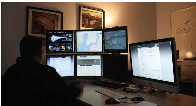
MST monitoring the airFiber link delivering NuVisions services

One of Maritime Parc's many selling points is its built-in technology infrastructure. Clients must consider the cost of the total package to conduct an offsite meeting. As part of the package, technology requirements are increasing as more clients use live streaming, videoconferencing, and Skype to share their events with people in remote locations. Maritime Parc effectively competes with hotels and other locales on technology capabilities and pricing. And if a specific event requires more bandwidth, Maritime Parc can arrange an increase in bandwidth on an event-by-event basis with MST.